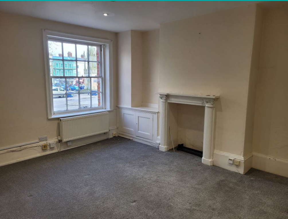
Office room 1.